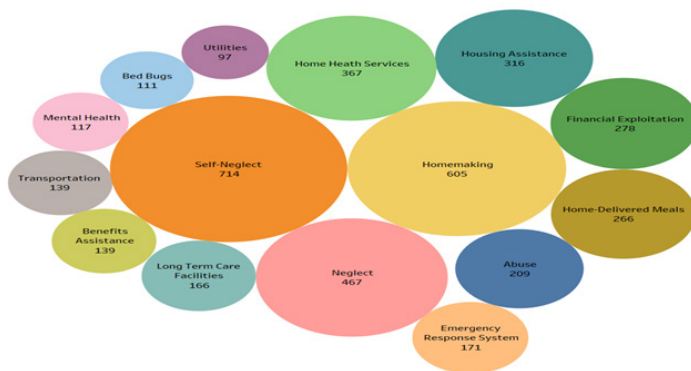
Main Reasons for Contacting DSAS (January-June 2017)

Customer Satisfaction surveys are mailed twice a year to a random sample of DSAS clients. More than 4,000 surveys are mailed during the year and there is a response rate of 30%. Below are some highlights from the 2017 mid-year customer satisfaction survey report.